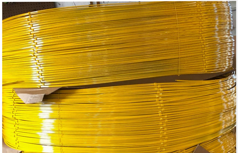
Available in various sizes and colors